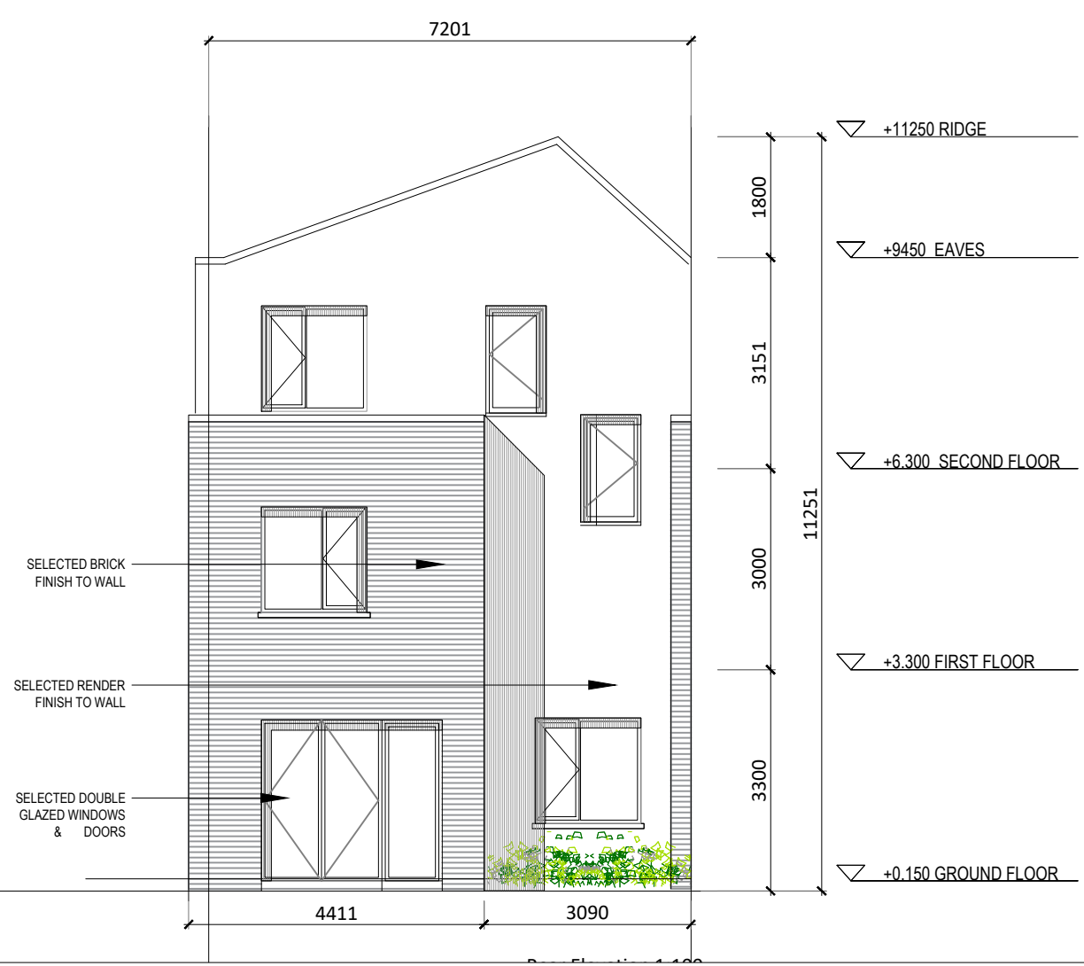
Duplex Type B1 Elevations & Section